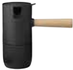
Collar espresso maker Art. no. 420